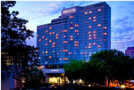
The Westin Ottawa hotel has implemented a number of responsible, environmentally-friendly policies to reduce its carbon footprint.

When one is asked to provide an example of an environmentally friendly or energy efficient business, a hotel is usually not the first place that springs to mind. Whether it's the continual washing of once used sheets and towels, or the individually wrapped soaps and lotions, the hotel industry seems to be an incredibly consumptive one, at first glance. However, the Westin Ottawa is proof that this need not always be the case.